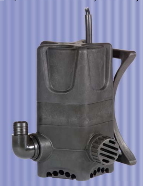
Dual Outlet Design It's like having two pumps in one (one outlet plug and one 90° 1-1/4" hose adapter included)

High capacity submersible pumps are safe for use in Koi or garden ponds. All pumps are fitted with 10m H07 cable and include a 90° outlet adapter for 1" hose, a removable base/handle, two outlets (can be used simultaneously or either outlet can used alone). Pumps can be placed in the pond either horizontally or vertically.